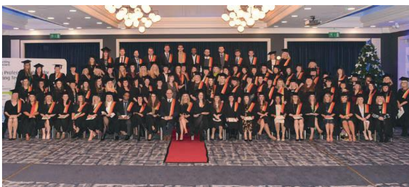
Graduands at the Dublin Conferring Ceremony