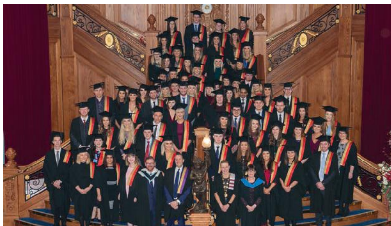
Graduands at the Belfast Ceremony